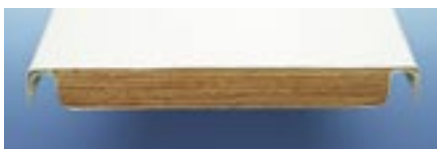
Frontier IV Board*