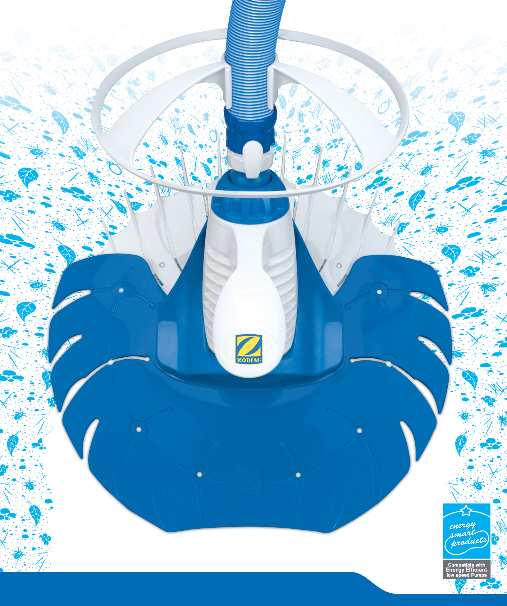
Engineering that exceeds expectations