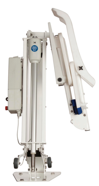
multiLift Optional Folding Seat Assembly (not available with fully rotomolded seat)