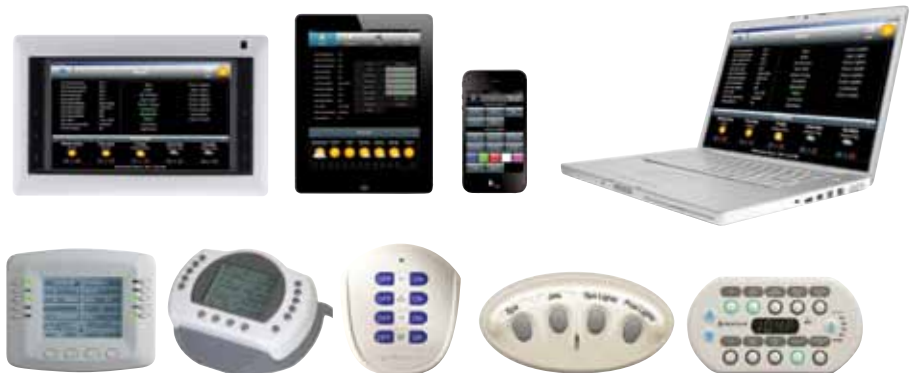
Photos show range of control devices available to interface with IntelliTouch systems—wired, wireless, push-button or touch screen—all are extremely easy to use.

For an overview of all the available ScreenLogic interfaces, see page 10.