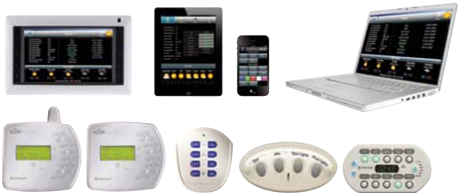
Photos show range of control devices available to interface with EasyTouch systems—wired, wireless, push-button or touch screen—all are extremely easy to use.