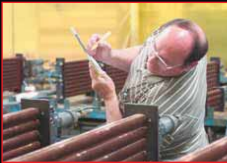
On-site state inspectors