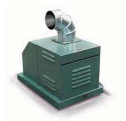
D-2 Power Vent

Using the Raypak-supplied adjustable 90° elbow, the flue gases may be discharged in any direction (see D-2 Power Vent manual for details). The D-2 Power Vent is also dual-voltage capable (120/240 volt) and engineered for long life and smooth operation.