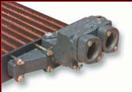
Cast iron headers