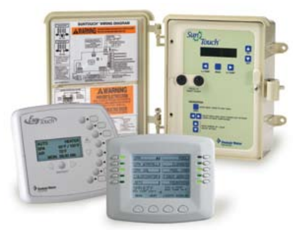
The QuickTouch Wireless Remote is used with any EasyTouch, IntelliTouch, or SunTouch control system.