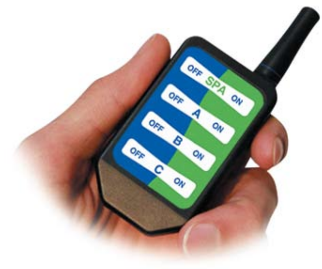
QuickTouch® Wireless Remote Part# 520148