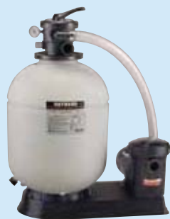
S180T 18" Pro Series Filter

High-powered, high-capacity system for larger above-ground pools.