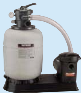
S166T 16" Pro Series Filter

Larger unit designed for most above-ground pools.