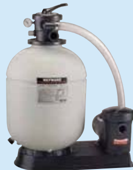
S210T 20" Pro Series Filter

Bigger filter and pump system provide greater filtration for above-ground pools and small in-ground pools.