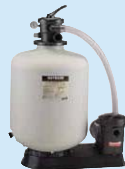
S230T 23" Pro Series Filter

Ultimate system for large above-ground pools and small in-ground pools.