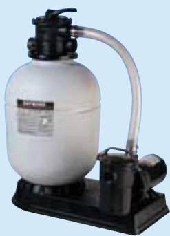
S144T 14" Pro Series Filter

Economical system for smaller above-ground pools.