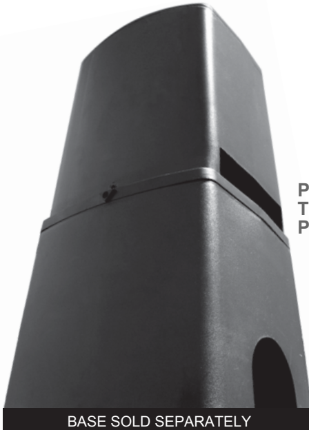
Power Tower PT-6000