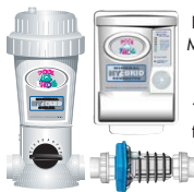
POOL FROG® Mineral Hybrid Combines Benefits of 2 Technologies for Complete Pool Care