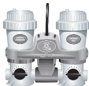
POOL FROG® XL PRO In Ground System with Ex-tended Pac Life