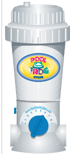
POOL FROG® IN GROUND CYCLOR