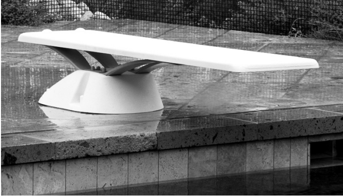
Part # EDGE-BASE (6' & 8' Edge Fiberglass Base & Jig) Part # EDGE-SPRING-GR (6' & 8' Spring Assembly)

NOTE: MUST ORDER 3 PARTS FOR A COMPLETE EDGE BASE AND BOARD COMBINATION.