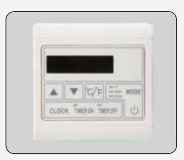
Digital thermostat control for easy operation and temperature display.