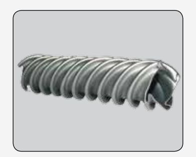
Titanium heat exchanger for durability and excellent corrosion resistance.

To take a closer look at Hayward Heat Pumps or other Hayward products, go to hayward.com or call 1-888-HAYWARD.