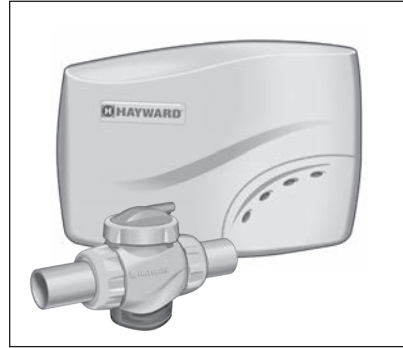
Salt & Swim 3C