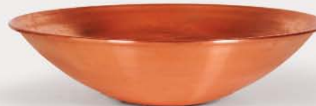
Tuscano (Copper) Oil Rubbed Bronze 31"OD x 11"H X 10"B