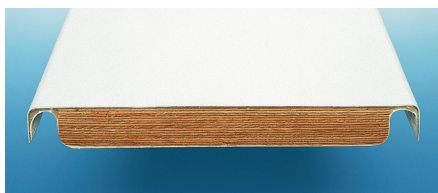
Frontier III Board