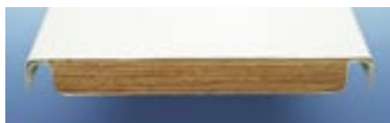
Frontier III Commercial