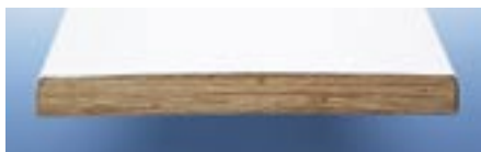
Eureka (14' only)