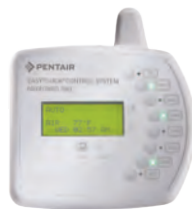
EasyTouch System Wireless Controller