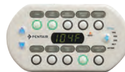
SpaCommand® Spa-Side Remote 10-Function Spa-Side Remote