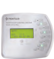
EasyTouch System Indoor Control Panel (4- or 8-Function Control)

EasyTouch systems are available for a separate spa, a separate pool, or a pool/spa combination with shared equipment. You select from systems that control four or eight accessory functions. Four-function systems are typically used to control pool and/or spa operation plus pool or spa lights and heaters. Eight-function systems allow separate scheduling for additional features, such as landscape lighting, waterfalls, fountains, additional heaters and more. Take the work and worry out of scheduling and operating pool and spa heating, filtration and cleaning cycles. For even greater convenience, you can add any of these optional controllers: