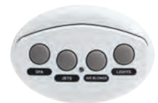
iS4 4-Function Spa-Side Remote