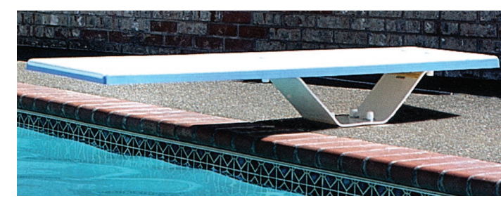
Frontier II Jump Stand