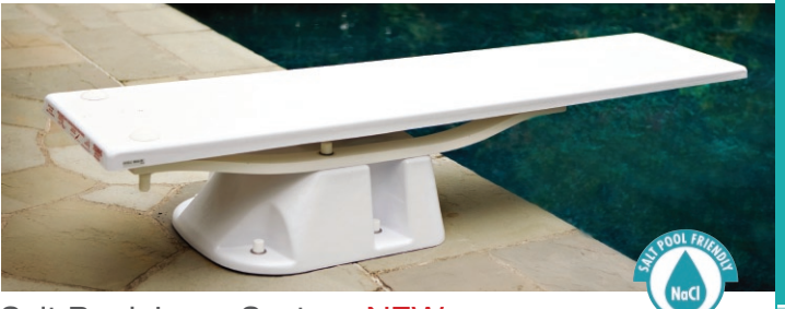
Salt Pool Jump System NEW