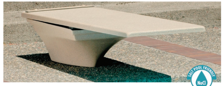
Flyte Deck II Stand