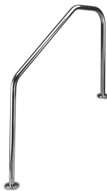
Deck to Stair Mounted 3 Bend Hand Rail Part# D3S4049