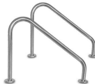
Deck to Deck Mounted Stair Side Mounted Rail Part# D2D3.0049

NOTE: Escutcheons sold separately w/ss products; included with powder coated ladders and rails. All measurements on center.