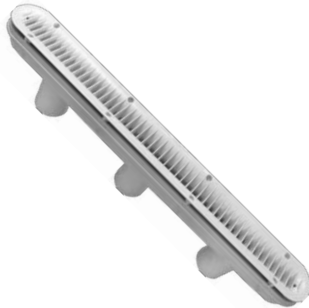
Model # 32CDFLACxxx