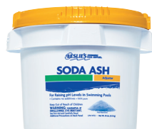
Balancers Correct your water balance