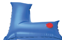
CLOSING ACCESSORIES Simplify your pool closing

If you have any questions, please call In The Swim® Residential Pools: 1-800-288-SWIM (7946) | Commercial Pools: 1-800-765-SWIM (7946)