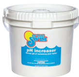
pH INCREASER Correct your water balance