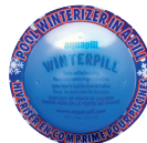
WINTERPILL Ensure an easier pool opening