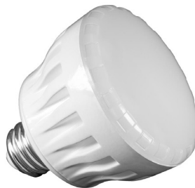
LED Spa Replacement Lamp