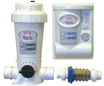
Mineral Hybrid Combines Benefits of 2 Technologies for Complete Pool Care