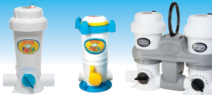
In Ground Mineral System