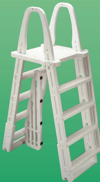
A Frame Ladder