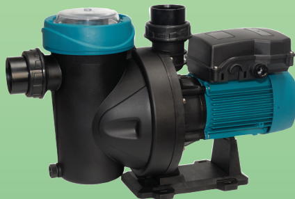
ESPA Silen I