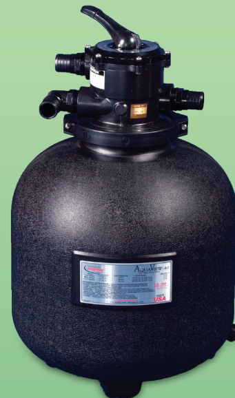
19" Sand Filter