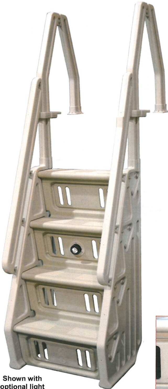
Shown with optional light