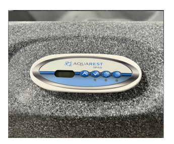
Easy-to-use Digital Controls