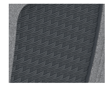
Elegant Wicker Panels