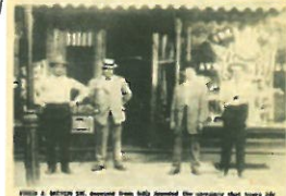
This Firm Travels 70-Year Path - From Awnings To Pool Covers