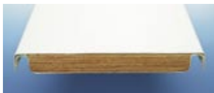
Frontier III Commercial