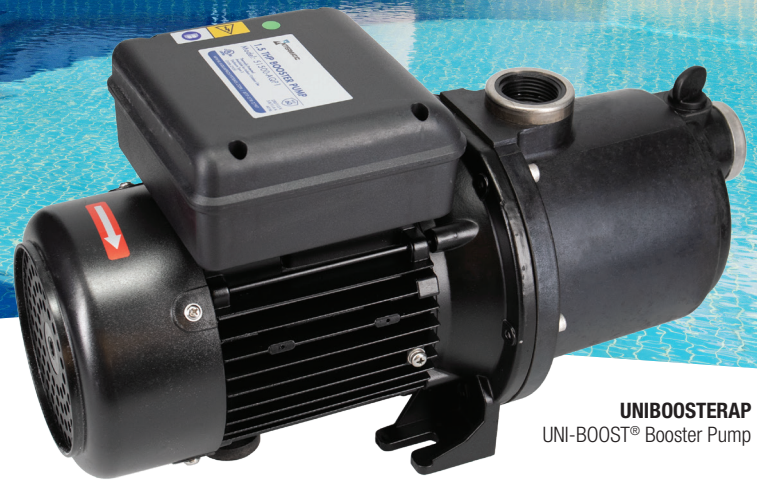
UNIBOOSTERAP UNI-BOOST® Booster Pump

In addition to its quiet design, the UNI-BOOST® Booster Pump with included hose kit delivers an extended motor life, which helps pool owners save money over the long run.